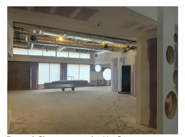
Typical Classroom at the YMCA