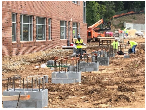
Canopy footers east elevation at WPA