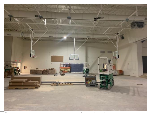
Gymnasium progress at the WPA