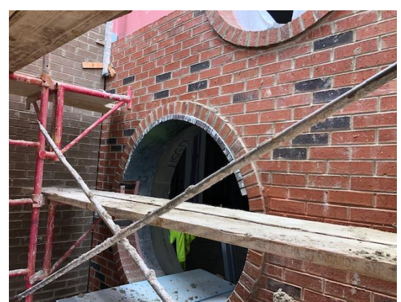
Roll-lock at round windows at the YMCA