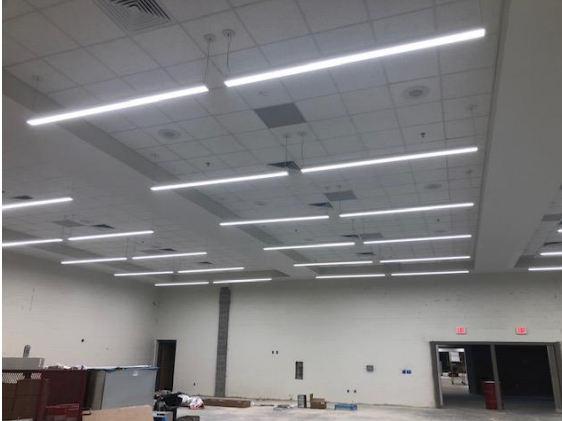
Cafeteria Ceiling and Lighting install at WPA